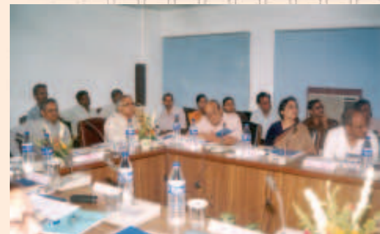
19 th SAC meeting in progress