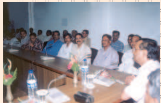
ICMR Foundation Day Celebration in RMRC, BBSR