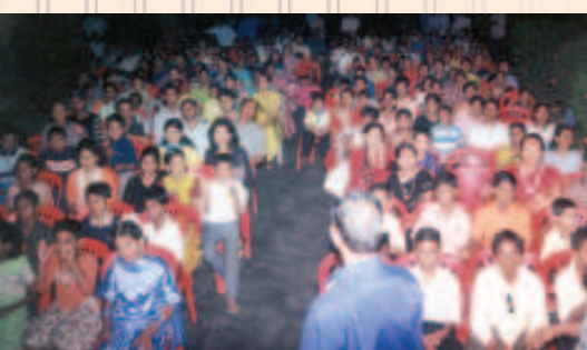
RMRC Foundation Day Celebration