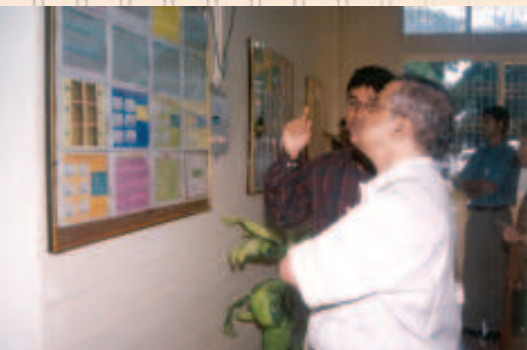
Poster presentation by research scholar during SAC meeting